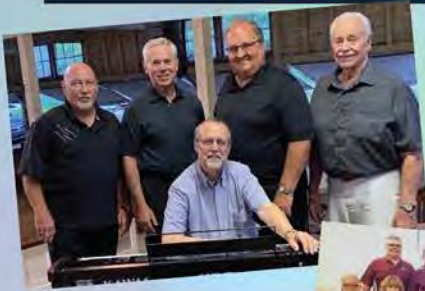
Sat, June 29 River of Grace Quartet

New Start Time: Events start at 6:30 PM unless otherwise noted.