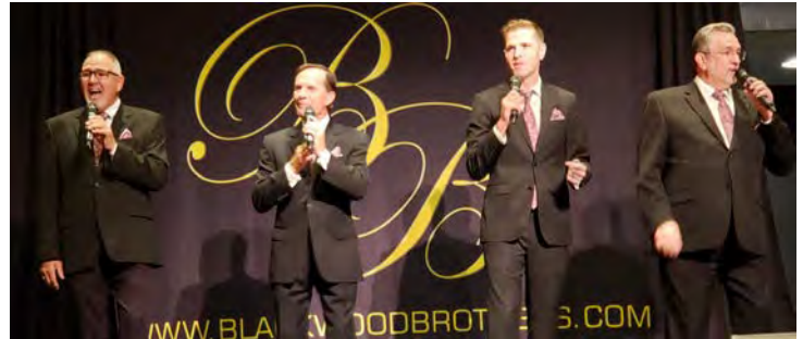
The Blackwood Brothers

Each year, the PSGMA inducts 3 individuals into the Pennsylvania Gospel Music Hall of Fame. In October 2023, another 3 well-deserving artists joined the Pennsylvania Gospel Music Hall of Fame Alumni. The HOF Banquet was held in Camp Hill, PA at the Christian Life Assembly Family Life Center and the program was opened musically with 2023's Keystone Award winners, The Bates Family. That was followed by the featured singing group, The Blackwood Brothers.