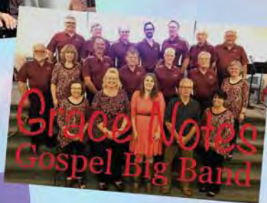
Sat, July 6 Grace Notes Gospel Big Band