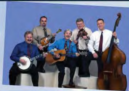
Sat, August 3 Sunnyside Gospel Bluegrass